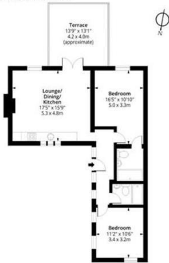
Ground Floor Floor Area 732 Sq Ft - 68.00 Sq M

Approx. Gross Internal Area 732 Sq Ft - 68.00 Sq M Approx. Gross Terrace Area 181 Sq Ft - 16.81 Sq M