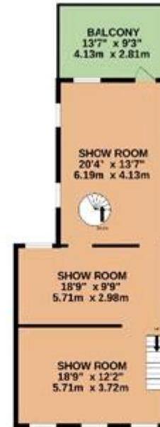
1ST FLOOR 647 sq.ft. (60.0 sq.m.) approx.